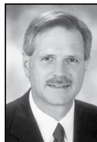
Gov. John Hoeven